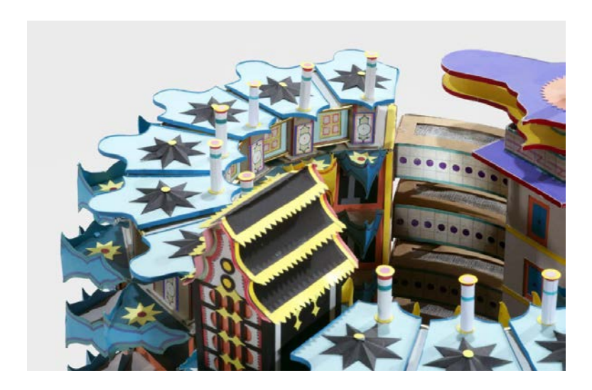
Bodys Isek Kingelez, Kinshasa la Belle (detail), 1991.