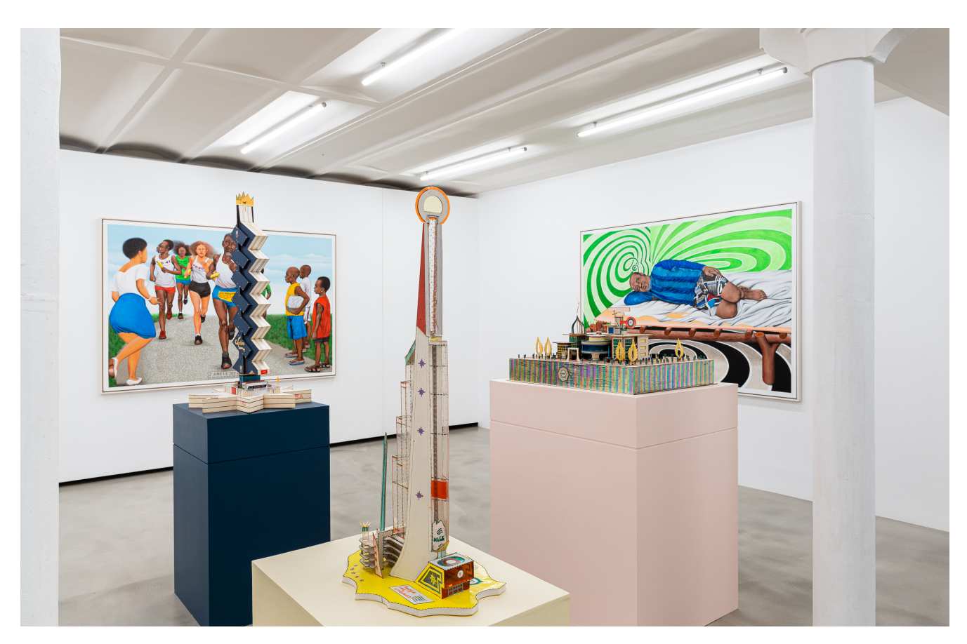
Exhibition Kings of Kin, gallery Magnin-A, Paris, 2020