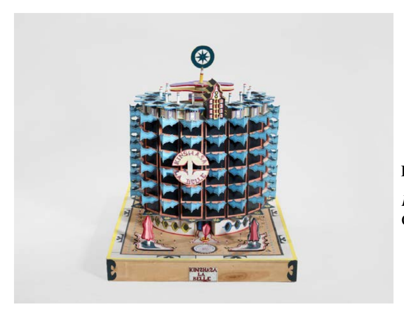
Bodys Isek Kingelez, Kinshasa la Belle (1991).

Museums in the Western world are working hard to broaden the cultural scope of their programs to make up for longstanding Western-centric blind spots. Next year, New York's Museum of Modern Art takes another big step in the right direction with the first full-dress retrospective for the stunningly inventive Congolese sculptor Bodys Isek Kingelez (1948–2015).