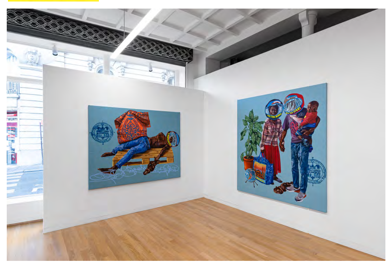
Exhibition Hilary Balu-Joseph Obanubi, gallery Magnin-A, Paris, 2021