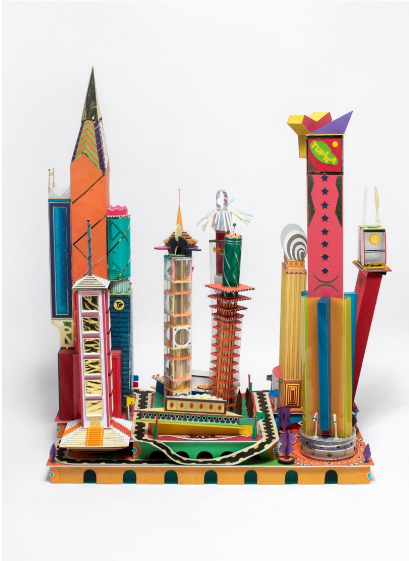
Bodys Isek Kingelez, La Tupina Restaurant , 2008, courtesy galerie Natalie Seroussi

"I discovered the Congolese artists in 2015, during the exhibition Beauté Congo at the Fondation Cartier. From this country, I only knew a darker side because of my role at the International Criminal Court. The vitality of its artistic scene immediately touched me, and since my arrival at the Galerie Natalie Seroussi, I had the willingness to contribute to its recognition. The Galerie Natalie Seroussi always promoted audacious dialogues between artistic movements and collaborations with other galleries. The exhibition KINGS OF KIN then naturally became part of our program and working with the Galerie MAGNIN-A gave to this project the dimension it deserved, combining our modern art experience to their fine and precise knowledge of the Congolese artistic scene. »