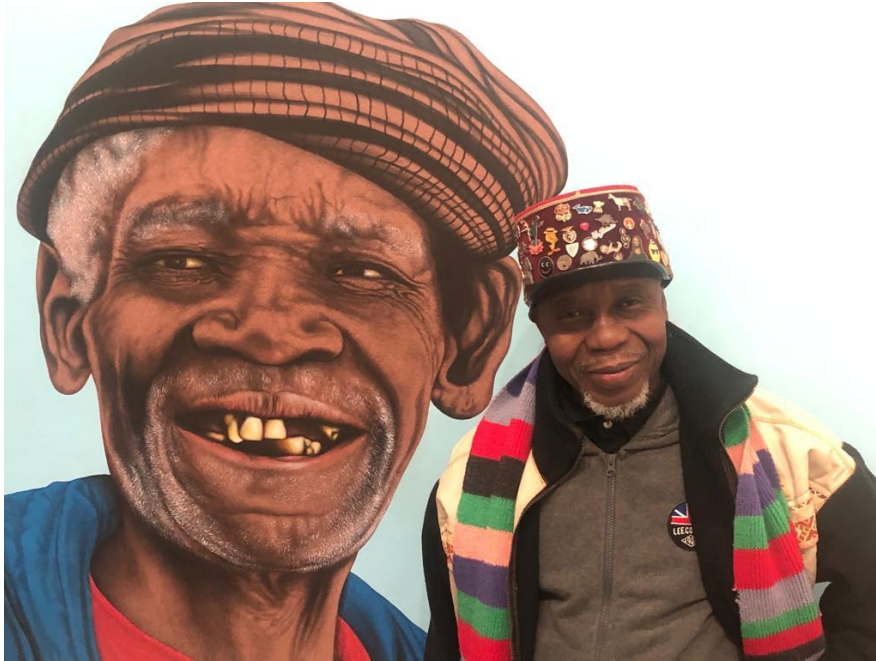
Chéri Samba, Astrup Fearnley Museet, Oslo, 2020

Born in 1956 in Kinto M'Vuila, Democratic Republic of the Congo Lives and works in Kinshasa, Democratic Republic of the Congo