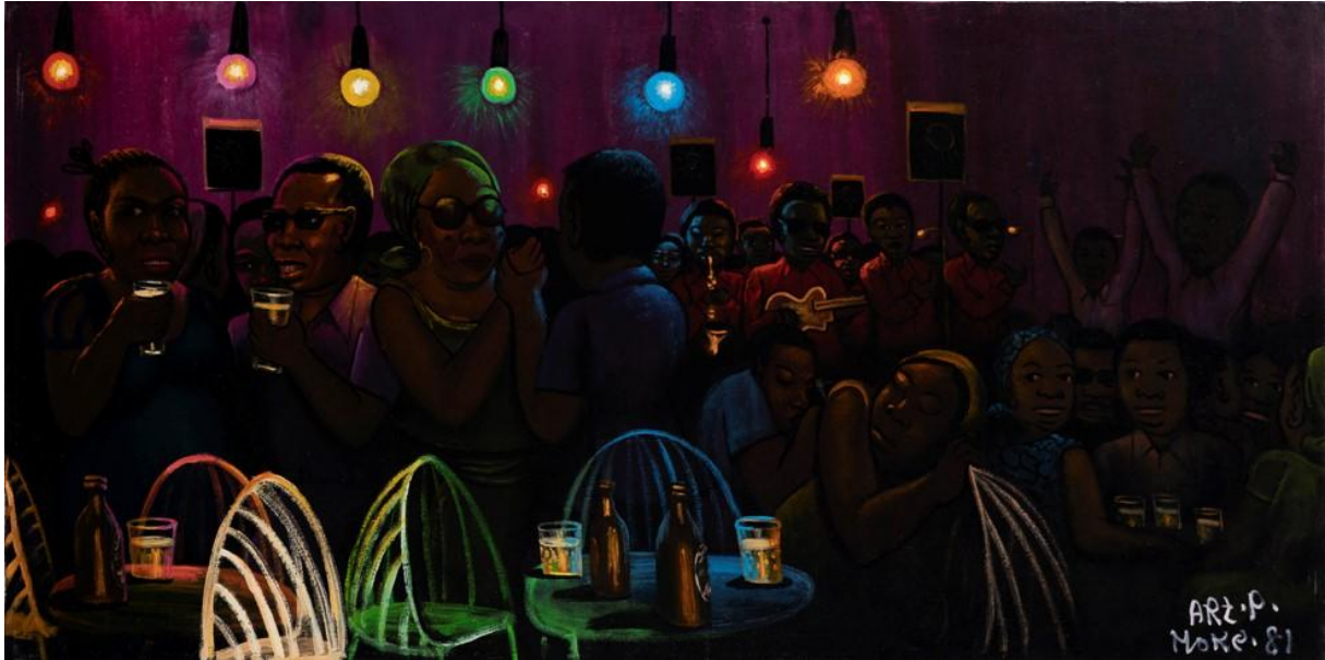
Moké, Bar Nocturne , 1981, Huile sur sac de farine, 95 x 188 cm, © Kleinefenn, courtesy galerie MAGNIN-A, Paris

« KINGS OF KIN gathers the work of three great artists I discovered in Kinshasa in 1987 and that I never left. I followed them and exhibited them in museums and foundations in the world word. Today, I am still gripped by the liberty, the humour and the beauty of the paintings of Chéri Samba and Moké, and fascinated by the redesigned world by Bodys Isek Kingelez. Only the Democratic Republic of the Congo can inspire such an artistic effervescence. Since Beauté Congo , the « Kings of Kin » are reunited again, and for the first time in art galleries. »