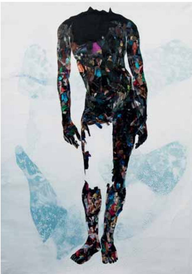
VITSHOIS MWILAMBWE BOND O | Untitled | 2015