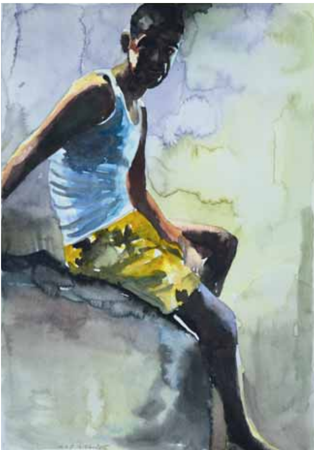
NOUR-EDDINE JARRAM | Zonder Titel | 2015