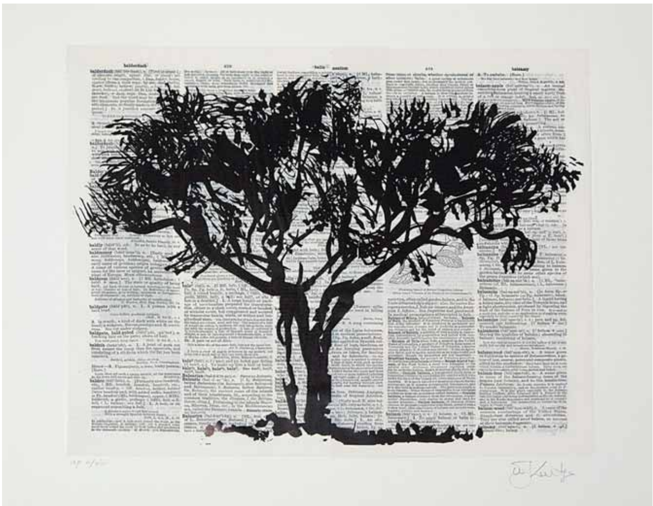
WILLIAM KENTRIDGE | From Universal Archive, ref. 56 (David Krut Projects) | 2012