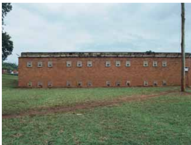
ZARINA BHIMJI | Da-Da | 2001 – 2006