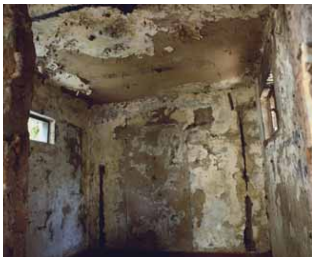
ZARINA BHIMJI | My Heart Was Beating Wildly | 2001 – 2006