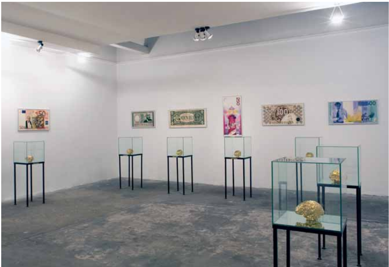
MESCHAC GABA | Wisdom Lake/Lac de Sagesse | 2009