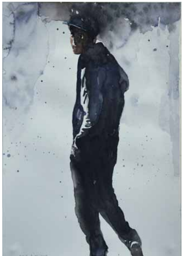
NOUR-EDDINE JARRAM | Zonder Titel | 2015