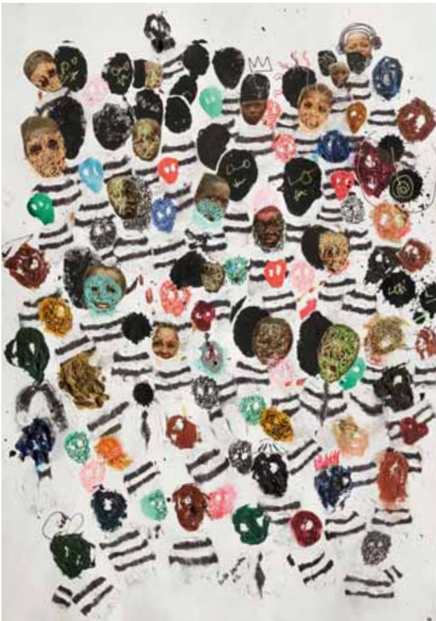
KURA SHOMALI | Les zazous de mon quartier | 2013