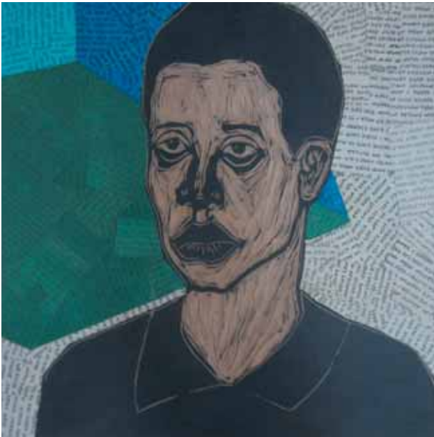
EPHREM SOLOMON | Untitled | 2015