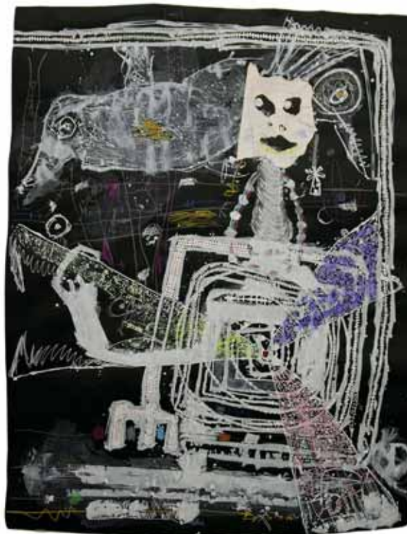
THIERRY OUSSOU | The Beautiful Dutch III | 2015