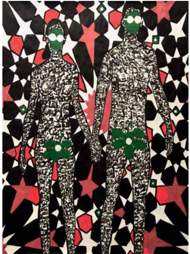
HAMID EL KABOUHI | mal din dymak/ What the fuck is with the religion of your mother, detail installation Nest, The Hague | 2015