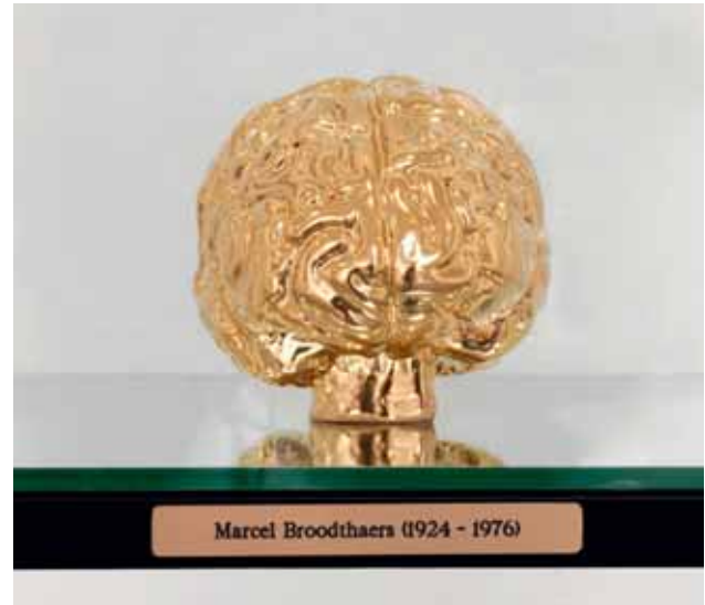
MESCHAC GABA | detail Wisdom Lake/Lac de Sagesse | 2009