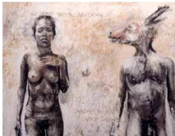
PHOEBE BOSWELL | Matatizo | 2015

Courtesy: Kristin Hjellegjerde Gallery, London ■