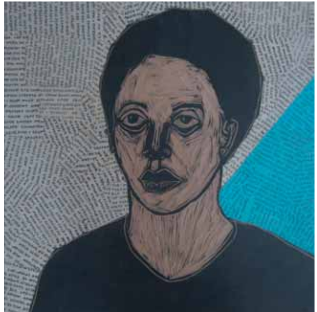
EPHREM SOLOMON | Untitled | 2015