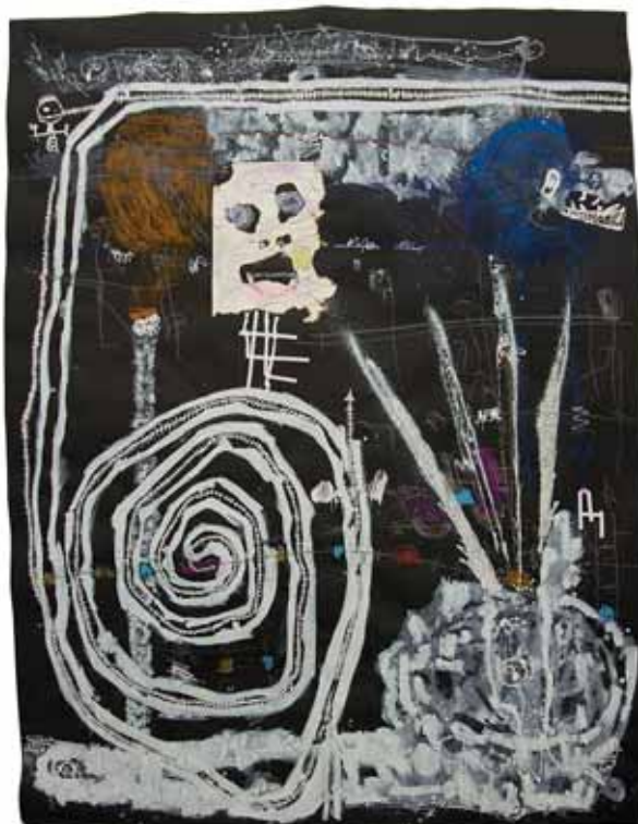
THIERRY OUSSOU | Contemporary Psalm I | 2015