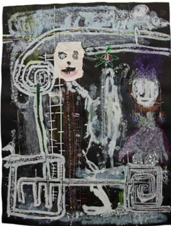
THIERRY OUSSOU | The Beautiful Dutch II | 2015