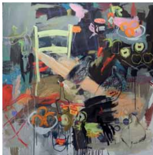
GOPAL DAGNOGO | Dinner with poultries | 2015