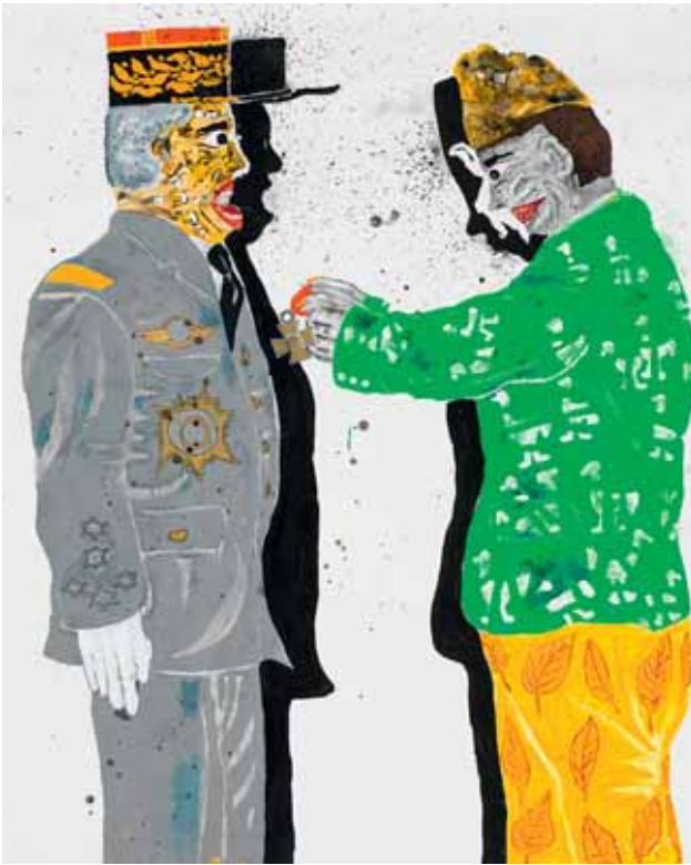
KURA SHOMALI | Untitled | 2014