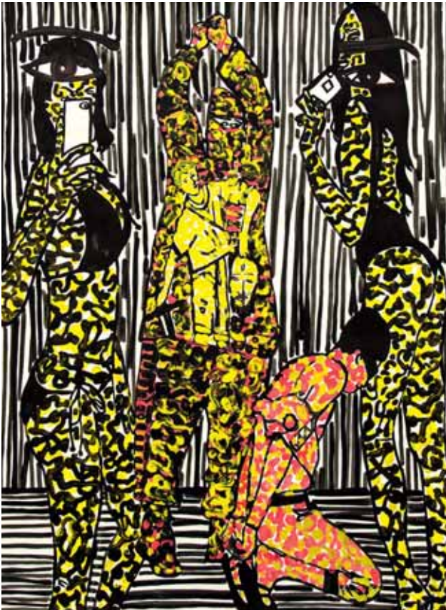
HAMID EL KABOUHI | mal din dymak/ What the fuck is with the religion of your mother, detail installation Nest, The Hague | 2015