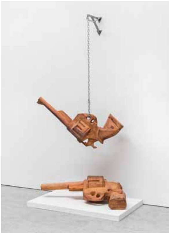
BARTHÉLÉMY TOGUO | Don't Shoot I, 2015 | 2015