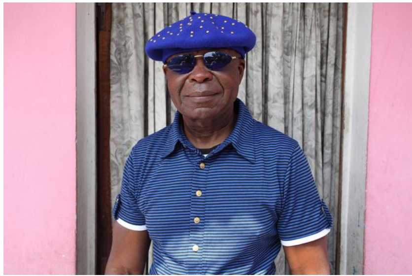
Portrait of Bodys Isek Kingelez by André Magnin, 2012. © André Magnin. Courtesy of gallery MAGNIN-A, Paris.

"Some of us had issues with the way that some of [Kingelez's] work was marketed from the beginning," says Okeke-Agulu. He objects to the claim that accompanied "Magiciens"—and percolated outward—that "only non-educated African artists can make original work—that the originality of African artists is destroyed with academic training."