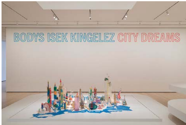
installation view of the exhibition

'bodys isek kingelez: city dreams' is on display from 26 may 2018 to 1 january 2019 at MoMA's philip johnson galleries . the exhibition is organized by sarah suzuki, curator, with hillary reder, curatorial assistant, department of drawings and prints, the museum of modern art. the exhibition design is produced in collaboration with the artist carsten höller.