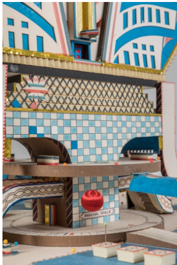
stars palme bouygues detail, same as before