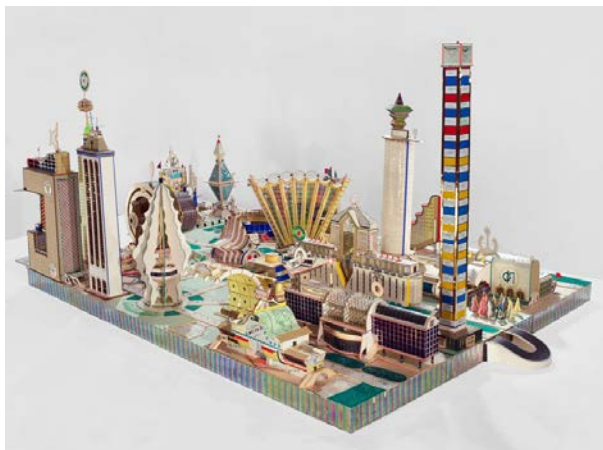
kimbembele ihunga, 1994, same as above