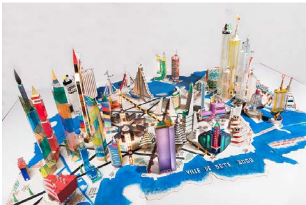
ville de sète 3009, 2000. paper, paperboard, plastic, and other various materials, 80 × 300 × 210 cm. collection musée international des arts modestes (miam), sète, france. © pierre schwartz adagp; courtesy musée international des arts modestes (miam), sète, france