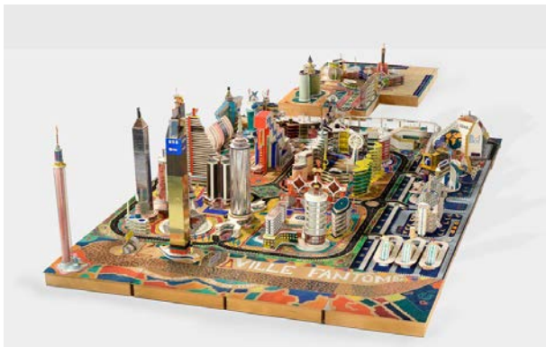
ville fantôme, 1996. paper, paperboard, plastic and other various materials, 120 × 570 × 240 cm. caac – the pigozzi collection, geneva. © bodys isek kingelez