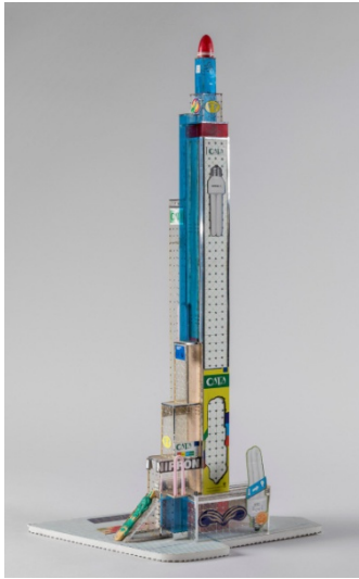
nippon tower, 2005. paper, paperboard, plastic, and other various materials, 67 \times 34 \times 22 cm, irreg.