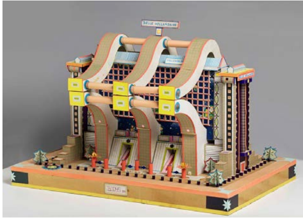
belle hollandaise, 1991. paper, paperboard, and other various materials, 55 × 80.5 × 56 cm. collection groningen museum.

born in the agricultural village of kimbembele-ihunga, in what was then belgian congo (now the democratic republic of the congo), bodys isek kingilez moved to the city of kinshasa in 1970. he started making art in the late seventies, when he found himself compelled to get his hands on ‘scissors, a gilette razor , and some glue and paper’ , and worked as a restorer of traditional objects for six years at the institut des museés nationaux du zaïre (now the institut du museés nationaux du congo) before devoting himself full-time to making his own art.