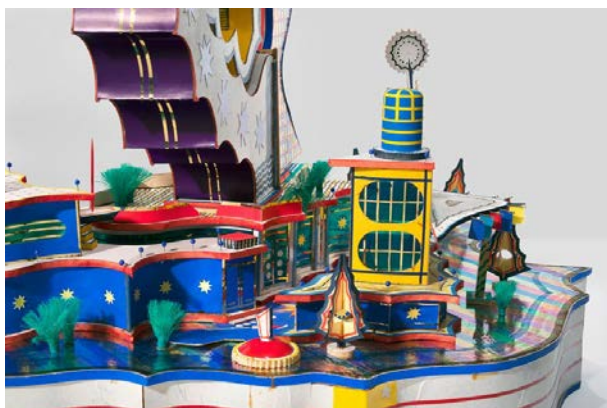
U.N. detail, same as before