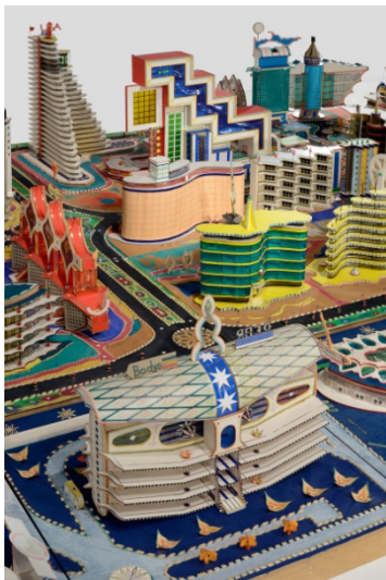
ville fantôme detail, same as before