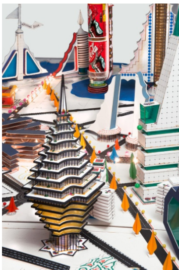
ville de sète 3009 detail, same as above