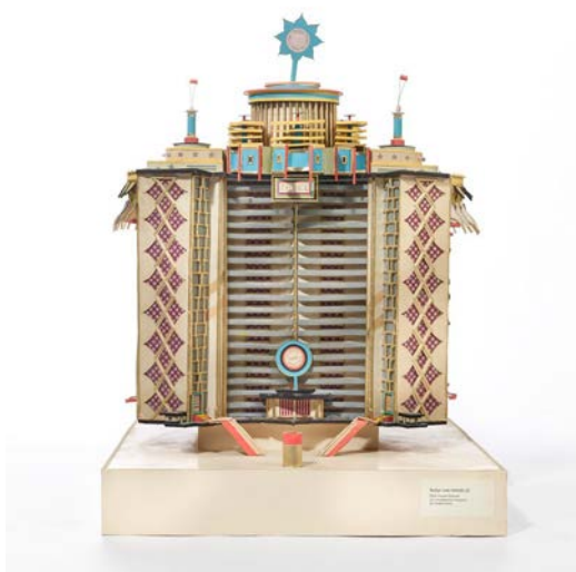
paris nouvel, 1989. paper, paperboard, and other various materials, 85 × 61 × 70 cm. long-term loan from the centre national des arts plastiques, france to the château d'oiron, france, fnac 981003. © cnap (france) / droits réservés; photograph by Frédéric Pignoux, studio ludo