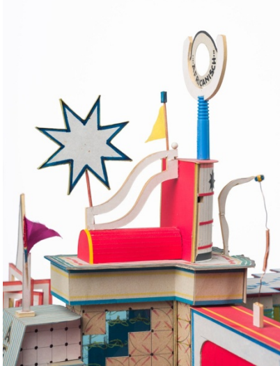
africanisch detail, same as before

various materials, 50 × 57 × 61 cm. private collection, paris.