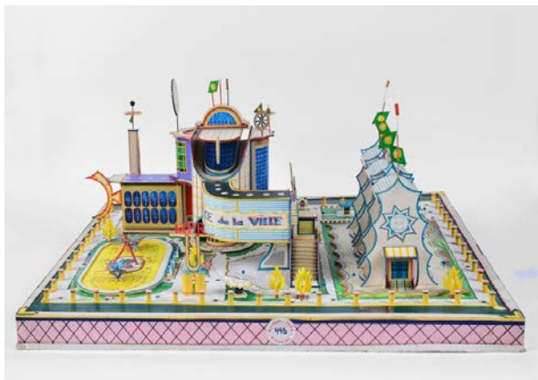
place de la ville, 1993. paper, paperboard, plastic, and other various materials, 40 × 85 × 75 cm. courtesy the museum of everything