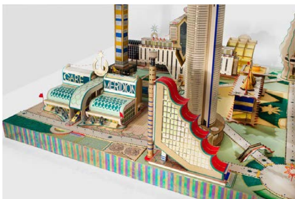
kimbembele ihunga detail, 1994. paper, paperboard, plastic, and other various materials, 130 × 185 × 320 cm. caac – the pigozzi collection, geneva. © bodys isek kingilez

reminiscent in color and vitality of the buildings of bolivian architect freddy mamani, kingilez’s ‘extreme maquettes’ represent fantastical, utopian models for a more harmonious society of the future. his work explores questions of urban growth, economic inequity, how communities and societies function, and the rehabilitative power of architecture, stemming from his own urban experience of a city (kinshasa) that grew exponentially and organically without adequate urban planning and infrastructure. reflecting dreams for his country, his continent and the world, his sculptures of imagined buildings and cities address social issues on a global scale . in the complex multi -building cityscape ‘kimbembele ihunga’ (1994), the artist imagines his home village complete with a soccer stadium, banks, restaurants, and skyscrapers , while in ‘ville fantôme’ (1996), kingilez has imagined a peaceful city in which doctors and police are not needed.