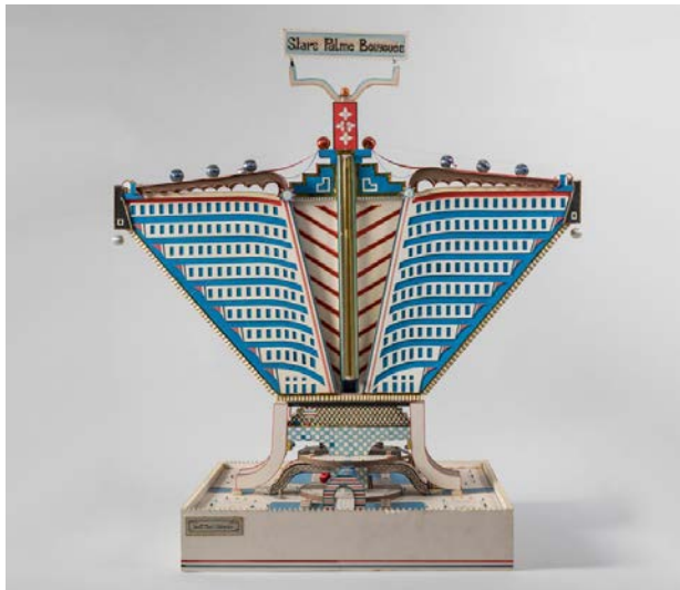
stars palme bouygues, 1989. paper, paperboard, and other various materials, 100 × 40 × 40 cm. van lierde collection, brussels. vincent everarts photography brussels