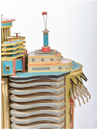
paris nouvel, same as before