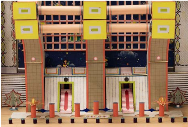
belle hollandaise detail, same as before