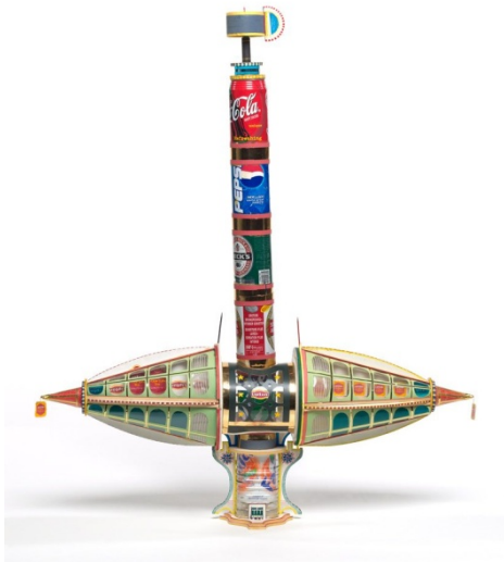
sports internationaux, 1997. paper, plastic, and other various materials, 90 × 85 × 25 cm, irreg. purchased 2013 with funds from tim fairfax, am, through the queensland art gallery | gallery of modern art foundation. collection queensland art gallery, brisbane.